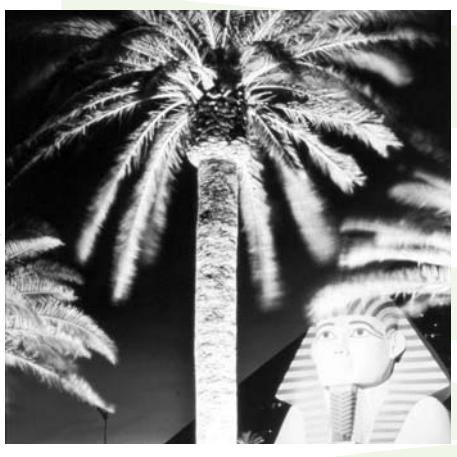
JEFF BROUWS, LUXOR CASINO AT SUNSET, LAS VEGAS, NY, 1996, TYPE-C PRINT, COLLECTION OF THE NEVADA MUSEUM OF ART, THE ALTERED LANDSCAPE, CAROL FRANK BUCK COLLECTION.

graphs that honor the topography of the new West through an exploration of land development and man's interaction with nature. Whether reflections of Las Vegas by Jeff Brouws, native American historical sites by Drex Brooks or Avi Holtzman's images of Israel that visually relate to the desert of the American West, the photographs from The Altered Landscape present a compelling vision of our environmental history and sense of place.