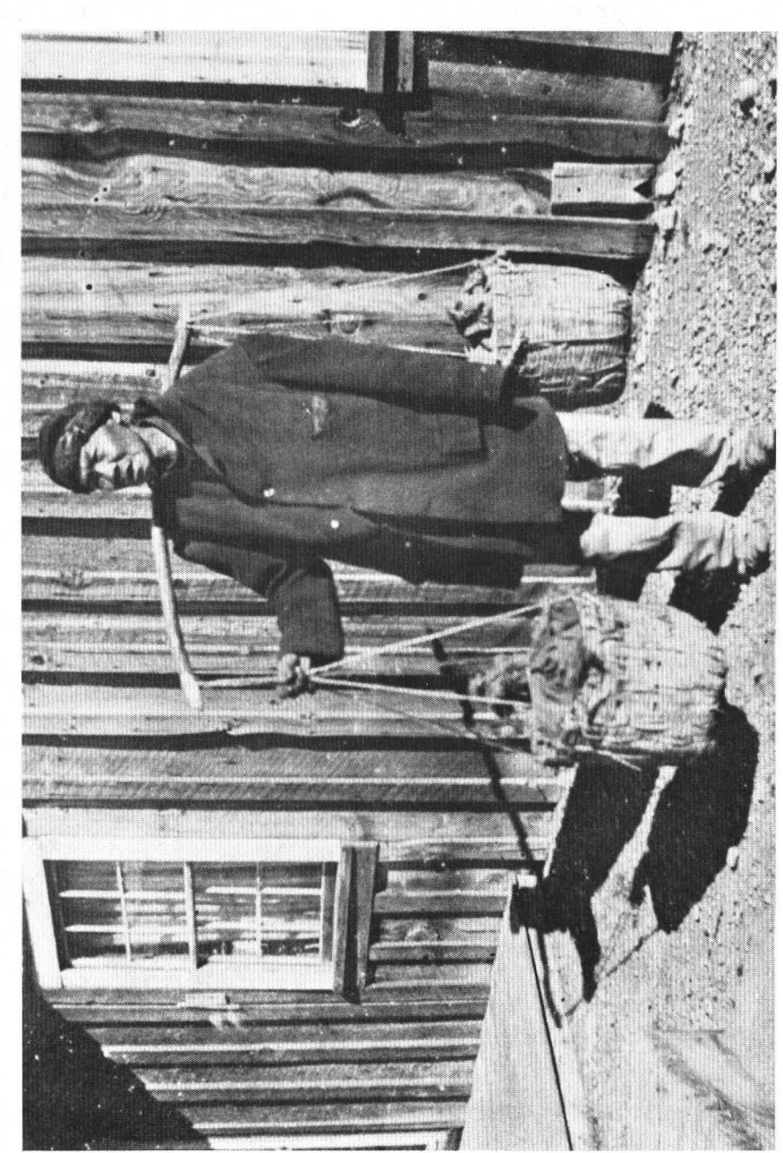
Chinese peddler in Dayton