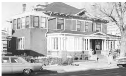
Nevada Historical Society