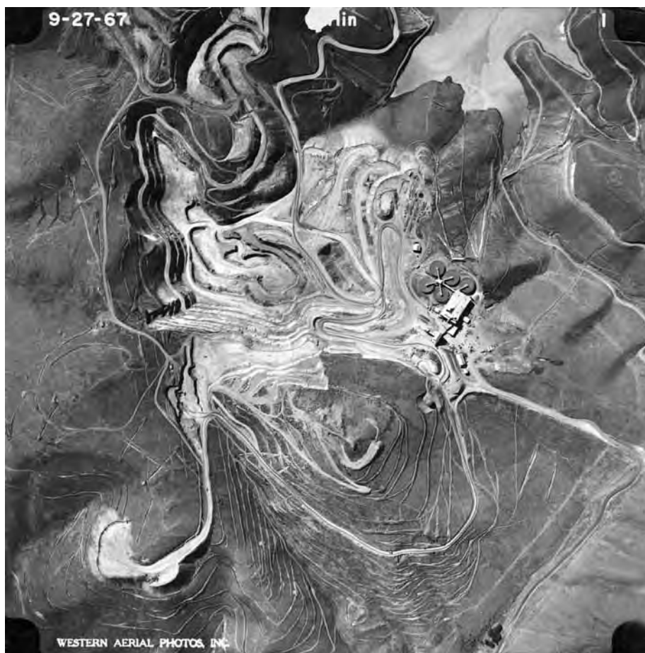
Aerial photograph of the Newmont Mill and Pit in Carlin, Nevada, 1967.

economies in which mining mattered little, but the rural parts of the state still leaned on mining as one of several important economic activities.