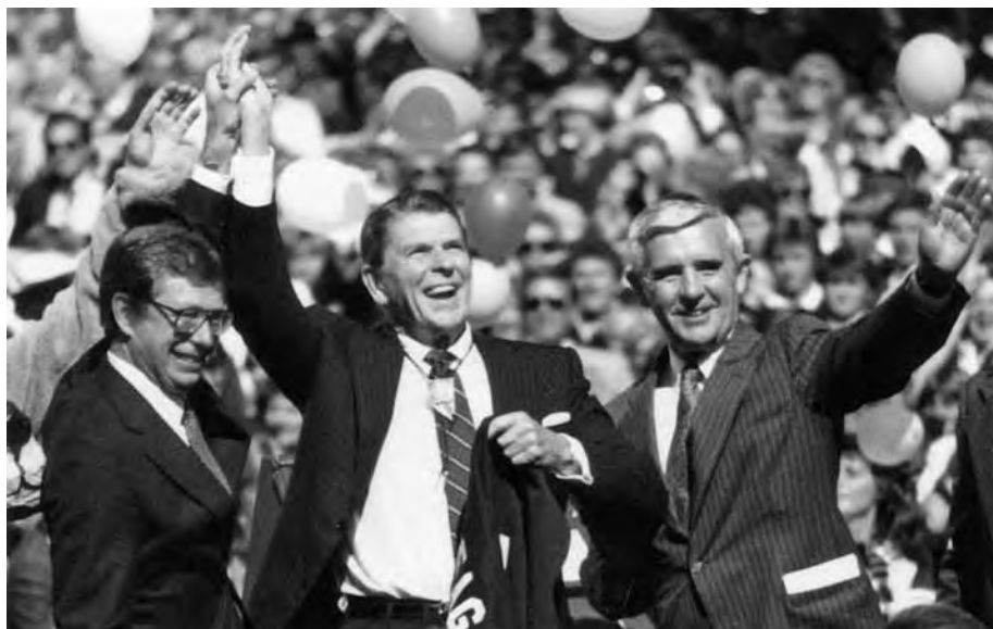
Governor Robert List with Paul Laxalt and Ronald Reagan, 1982.