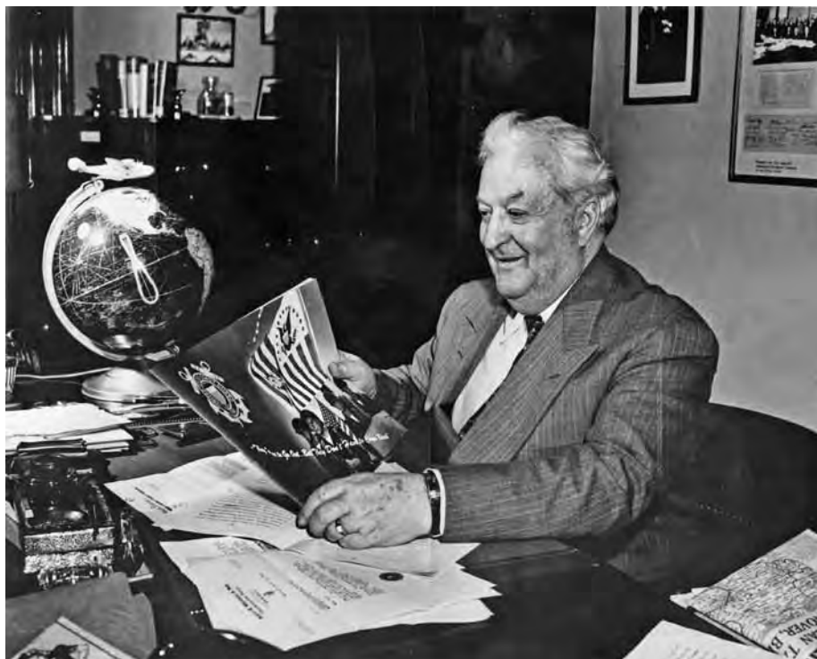
Senator Patrick McCarran in his office, ca. 1942.

a prime slot for doling out money and the latter for making deals with other senators who wanted their judicial nominees confirmed. These posts positioned him to engage in horse-trading for Nevada and to deliver federal pork, and he contributed to the establishment of military bases and the Basic Magnesium plant for World War II and the Nevada Test Site afterward. Nor did he hesitate to use his power for individual Nevadans: He carved up his staff positions so that he could give patronage jobs to young men going to law school; he hectored the military on behalf of Nevada prisoners of war and students; and he aided constituents having trouble with federal agencies.