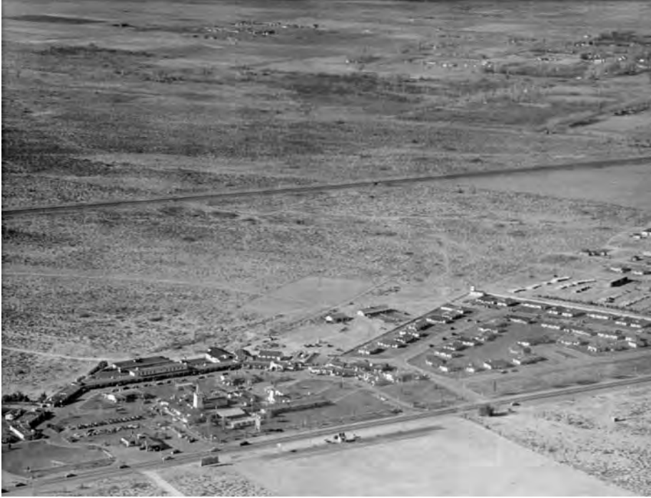
Panoramic view of the El Rancho Hotel, Las Vegas.

project who were spending their federal paychecks. At the end of the 1930s, Clark County reported a gaming win about half as large as Washoe County's. 19