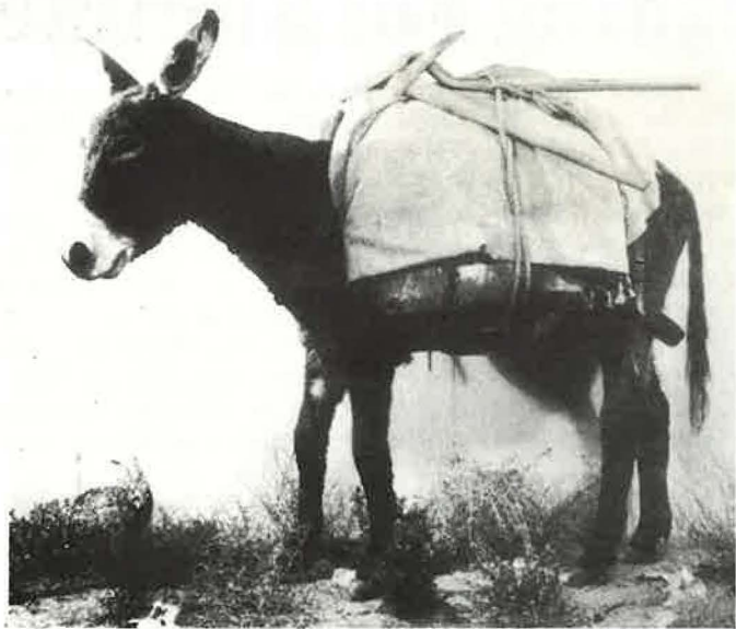
The burro has been a favorite of visitors to the Nevada State Museum for many years, and is now a fixture in the Ghost Town display.