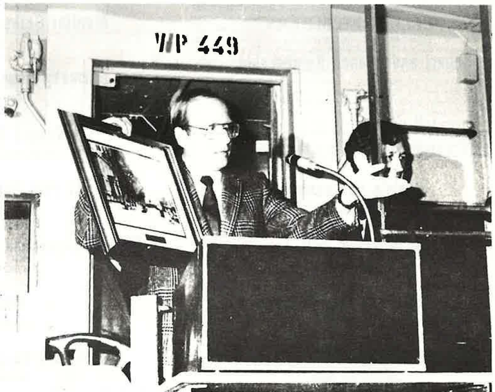
During the February Nevada State Railroad Museum Legislative Reception, Governor Richard Bryan presented a painting to Union Pacific officials. The governor is shown explaining the relationship of the art work to UP's past.

Docent Council NEVADA STATE MUSEUM Capitol Complex Carson City, Nevada 89710