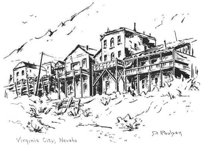
Virginia City, Nevada

The Nevada Humanities Committee has announced that May 19 and Sept. 15 are the 1989 deadlines for grant proposals. Prospective applicants may contact either the Reno office, P.O. Box 8029, Reno, NV 89507, phone 784-6587, or the Las Vegas office at 4765 Brussels Ave., phone 798-0337.