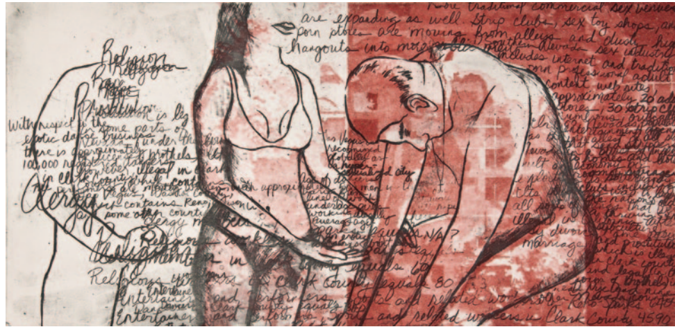
Pleasure Garden Candace Nicol, Reno and Jeanne Voltura, Las Vegas Four color etching, linocut, glitter 10" x 20" 2010