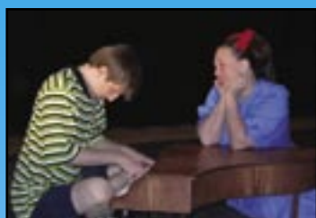
"You're a Good Man, Charlie Brown"