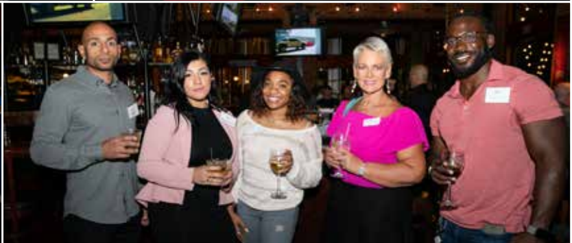
Vegas Young Professionals and Vegas Chamber members mixed and mingled at Gordon Biersch Brewery & Restaurant at the Fall 2018 Business Blend.