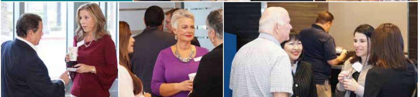
We were excited to meet each of our new members as they connected with fellow Chamber members, Chamber staff and our volunteer Prospectors and Ambassadors at the New Member Orientation. The program included a brief overview of Chamber membership benefits, as well as the Chamber's role in the greater context of Southern Nevada's economy. Be sure to check out page 33 for a full list of our newest members!