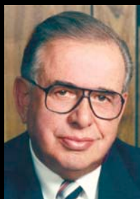
Marv Teixeira MAYOR

Proud to be Nevada's State Capital, Carson City will perpetuate its heritage, cultural diversity and natural setting by providing a well-planned community for people of all ages and backgrounds. We will work together under an open government process to guarantee the best possible environment of public safety, a strong economy, and an effective infrastructure. Quality education and recreation will provide our citizens with a sense of well-being and personal freedom. Carson City will continue to be a leader in effective local government.