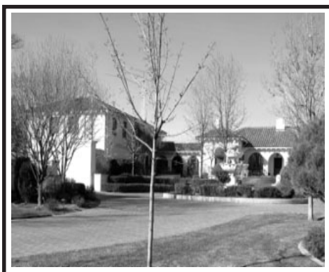
Hood's High Society Medical Mansion