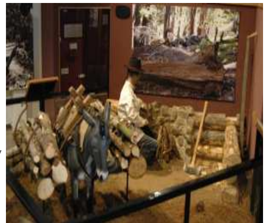
Pack saddle on display in exhibit.