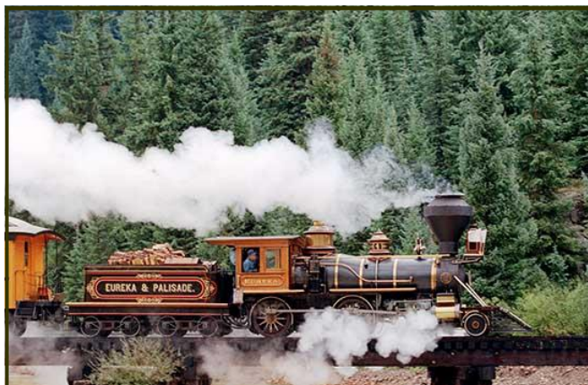
Eureka & Palisade Railroad locomotive No. 4 . crossing the Animas River

cab and walked forward, to my utter astonishment, there was a man lying on the track. I rushed up to him and saw he was seriously injured. The rest of the crew came forward and we quickly determined