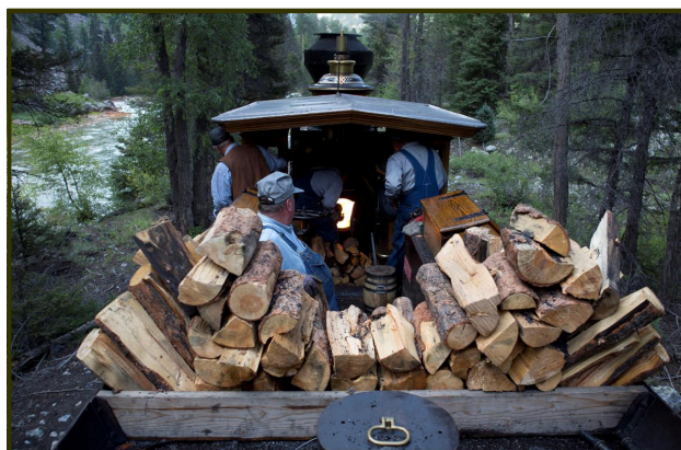
Cab view of Eureka with a tender full of fuel

I later learned that the injured man had been taking pictures from the cliff above the tracks and slipped on the rain soaked rocks. He fell quite a distance and landed on the tracks. The glint of light I saw which made me stop Eureka was from a small LED light the injured man had. He signaled me with it. After he got back to Silverton he was taken to Durango by helicopter to the hospital, and he was then flown to Den-