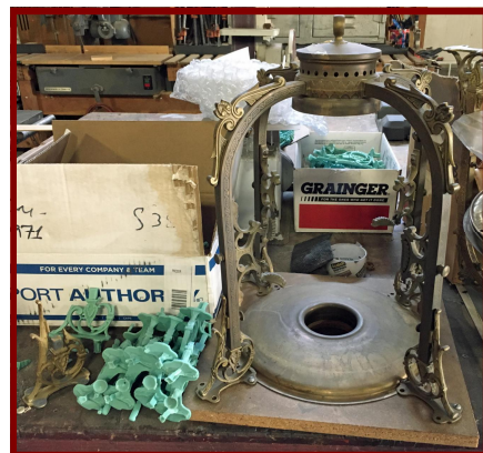
Lamp produced in 1983 by Shortline Enterprises, and the moldings that will be used to make the castings for the new lamps.

Each lamp has four embossed legs. The square brass tubing comes from