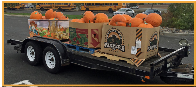
Pumpkins being delivered for the Harvest Train Pumpkin Patch (2015)

showcase local vendors selling hand-made items. There will also be a Scarecrow Art Show and Auction, with scarecrows made by children at a local elementary school. All the proceeds from the auction will go back to each classroom to help the teachers purchase supplies for their classrooms. We will have food trucks, Nevada Nosh and Taste of Chicago. Sassafras will be on site selling craft beers and house made sodas. We will also