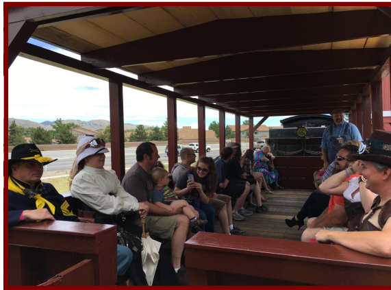
Visitors enjoy a ride in the recently overhauled V&T tunnel car #53 at the Steampunk 'N' Trains Event

seum. Best of all, visitors were able to take a train ride on their choice of the steam train pulled by the V & T locomotive #25, the McKeen motor car, or both. We would like to thank our special guests, members of High Desert Steam, for attending in full steampunk attire. The event helped raise money for the Friends to support future events and projects at the museum. Next year the Steampunk NqTrains event is proposed to last two days with the possibility of a private Steampunk event in the evening. Thank you all for attending and making this 1 st Annual Steampunk NqTrains event a memorable one. 🚂