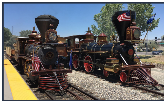
The Two Beauties - Glenbrook & Inyo Steamed Up

For the third year in a row the museum offered an all-inclusive wristband for sale. For $15 each day, adults received admission to the museum and unlimited train rides aboard No. 25 and the McKeen Car. On