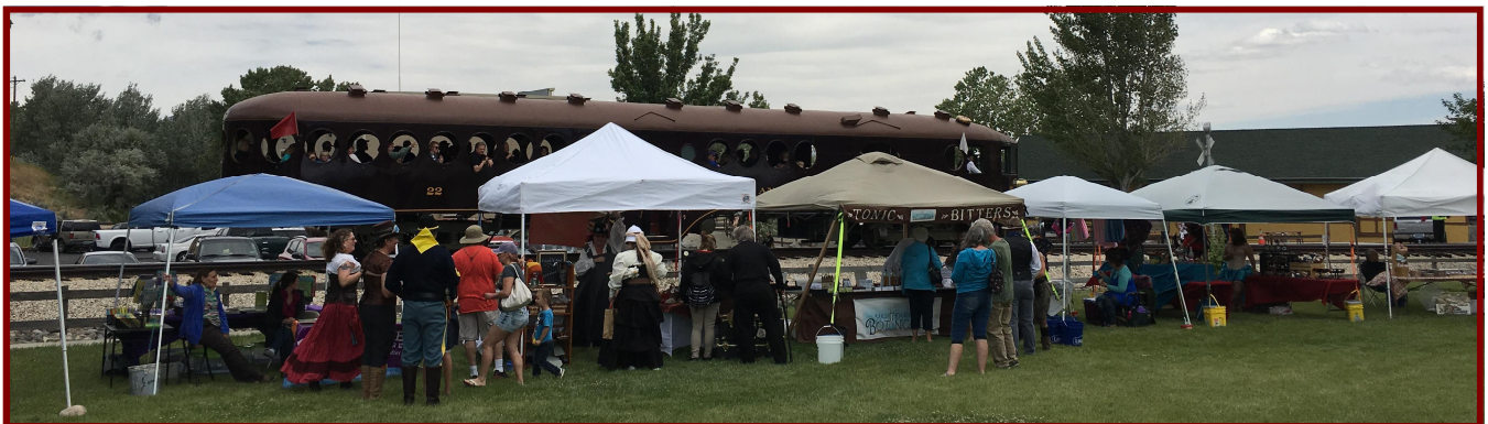
The McKeen Motor Car cruises past Gibson Park, full of vendors and guests enjoying the Steampunk 'N' Trains festivities

gathering was a huge success. There were craft booths set up in Gibson Park where people could buy various types of steampunk gear, books, snack