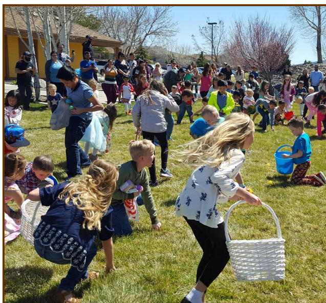
Children rush into Gibson Park to collect Easter eggs during the museum's first annual Egg-tra Special Express weekend.

The hunt was on at the NSRM as the museum hosted its first annual Egg-tra Special Express. It was a two-day event during Easter weekend. Our first (Continued on page 6)