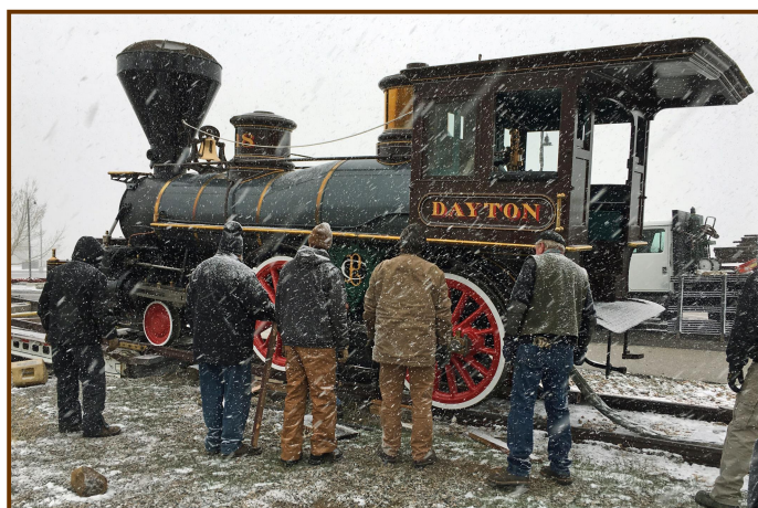
Museum staff and volunteers load V&T No. 18, the Dayton, onto a trailer in Virginia City.

The Nevada County Narrow Gauge Railroad Museum acquired former Nevada-California-Oregon Railroad Coach No. 52 (ex-Florence & Cripple Creek No. 52) from the museum. The car (Continued on page 4)