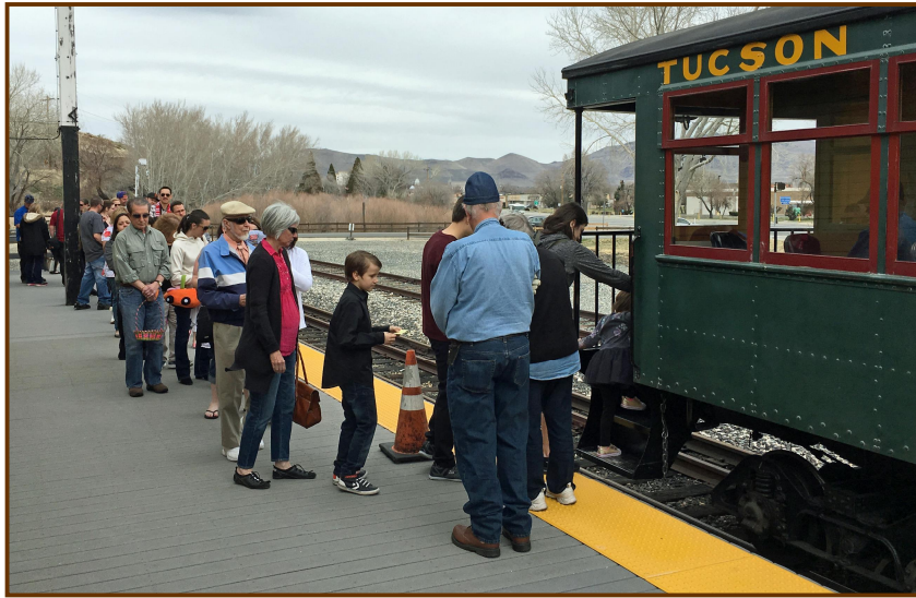
Long lines of riders wait to board the Tucson, Cornelia & Gila Bend Railroad Edwards Motor Car during the Egg-stra Special Express weekend at NSRM.

hunt was on Saturday at 11am for children ages 0-3. As I left my office and headed towards Gibson Park with the eggs I started to wonder if I had enough! The park was surrounded with families and dressed up little ones with their baskets in tow. We blocked off half of the park and as we begun to fill it with eggs you could see the excitement in the children and the parents. We walked around the crowd and explained that this was the museum's first egg hunt and that we were hoping to re-use the eggs for the following year. Turns out we needed to re-use them for the very next day! We did the countdown and within moments the 500 eggs that a few outstanding volunteers and I had stuffed were gone. There were many happy families sitting in the grass and opening their eggs. We had filled approximately 500 eggs for each hunt and we estimate that the museum got over half of them back to re-use. When the countdown got to zero for the second group, ages 4 and