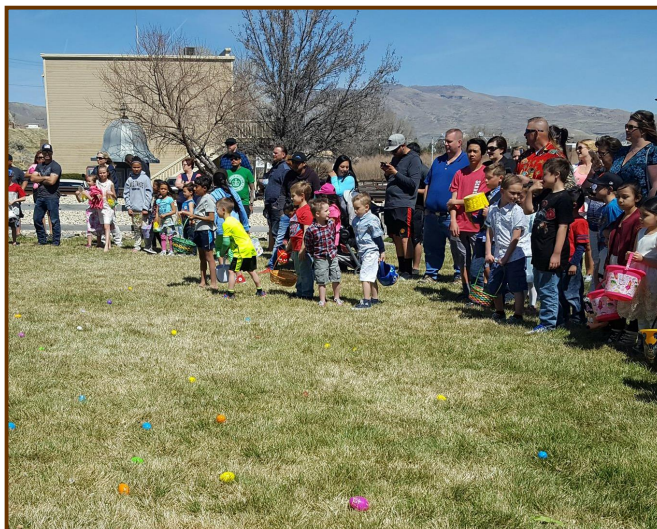
Children scope out which eggs they will grab while they wait for the countdown to begin during one of the Easter egg hunts in Gibson Park at the Egg-stra Special Express weekend.

The Egg-stra Special Express at the Nevada State Railroad Museum proved very popular. We hope for next year's event to be just as well-received. Thank you to all the volunteers and staff who helped to make this happen. It is because of you that many families leave the Nevada State Railroad Museum with a smile on their face. If you think museums are boring, then you're doing it wrong! 🚂