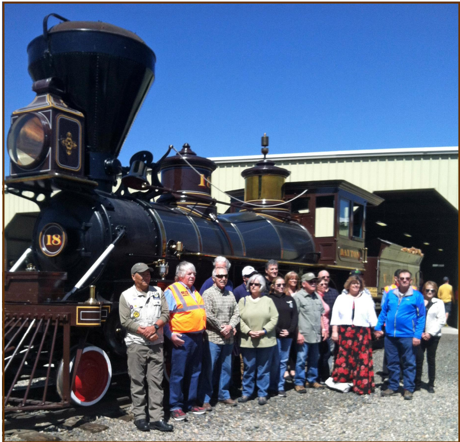
Students of the Washoe County Rail Auxiliary Team receive their certificates and badges during a graduation ceremony at the museum on April 28, 2018.

The Rail Auxiliary Team, also known as the "Rat Pack," is a group of trained volunteers under the local sheriff or Law Enforcement agency. They receive eight hours of rail specific training on everything from how to correctly, accurately and efficiently report trespassers on rail property, terrorism on the rail infrastructure, and suicide awareness training provided by the Nevada State Suicide Prevention Office. There are currently two "Rat Packs" in the region: one in Washoe County and one in Storey County. There is a grand total of approximately 95 trained eyes and