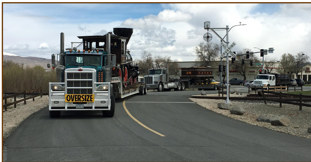
V&T No. 18, The Dayton , arrives at NSRM after its journey from Carson City (above). A crew from the Nevada County Narrow Gauge Museum loads former N-C-O Coach No. 52 on March 31 (below).

was built originally as a second class coach in 1897 by the St. Charles Car Company of St. Louis. In 1915 the N-C-O purchased No. 52 along with several other railroad cars from the defunct F&CC. The car operated on the N-C-O until 1928 when the new owner, the Southern Pacific, standard gauged the railroad. The museum acquired No. 52 in 1984.