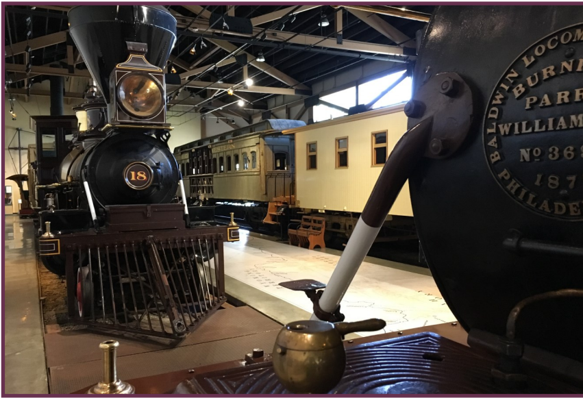
Virginia & Truckee locomotives No. 18, the Dayton, and No. 22, the Inyo (foreground), face pilot-to-pilot in the recently installed exhibit commemorating the 150th anniversary of the completion of the Transcontinental Railroad.

improves and we have added two part-time positions that that allow us to open Wednesday through Monday year-round. We have been trying to get back to these hours for quite a few years and in the last legis-