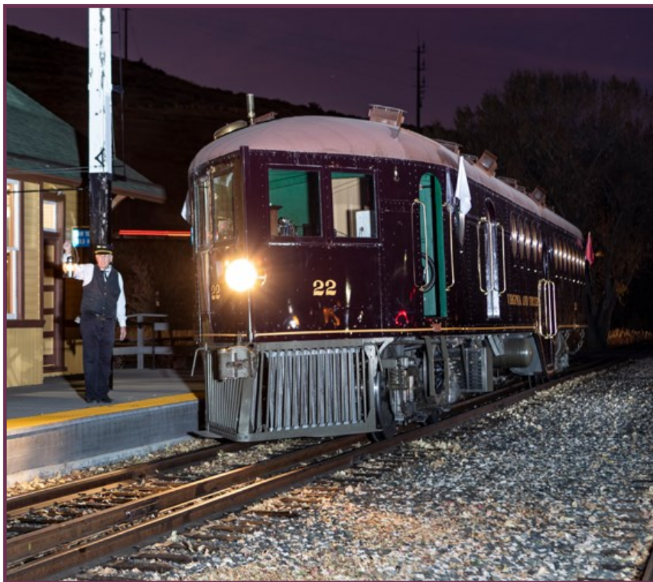
The conductor prepares to give a highball signal to the motorman on the McKeen Motor Car as it gets ready for departure from the Wabuska Depot.

The night photo shoot was a great success. The volunteers enjoyed bringing out the railroad equipment for a special event. The visitors participating in the photo shoot liked having the opportunity to photograph the museum's unique railroad equipment in a special setting. Thanks to Cristol Digangi for