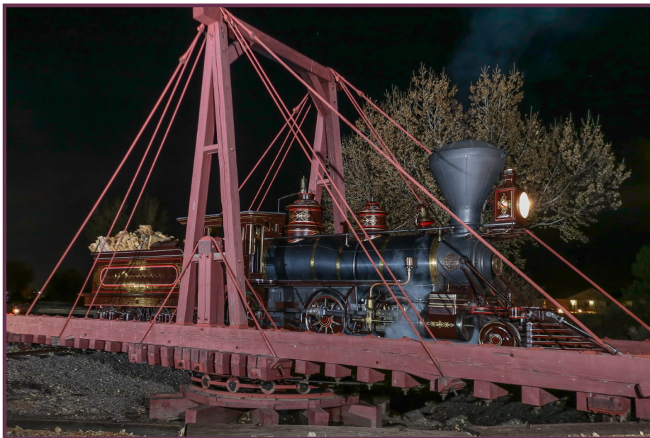
(Above) The Glenbrook prepares to take a spin on the turntable before retiring for the evening. (Below) Passengers mill about on the platform of the former Southern Pacific Wabuska Depot as the Glenbrook looks on.

skies. By nightfall the temperatures dropped, but the conditions were fantastic for night photography. The event started in the afternoon with V&T No. 25 hauling a mixed train around the loop. The consist included three other pieces of V&T rolling stock: boxcar No. 1013, flat car No. 162, and coach No. 10. The train operated around the loop in a counterclockwise fashion, which was a little unusual. However, it was a great opportunity to get some good