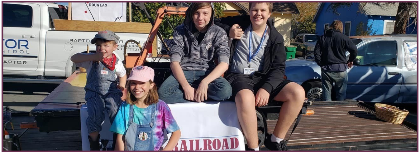
(Above and below) Volunteers and Friends of NSRM members with the Nevada Day Parade float.

For the first time in several years, the Nevada State Railroad Museum entered the 2019 Nevada Day parade with the museum's hand car and the support of our Friends and volunteers.