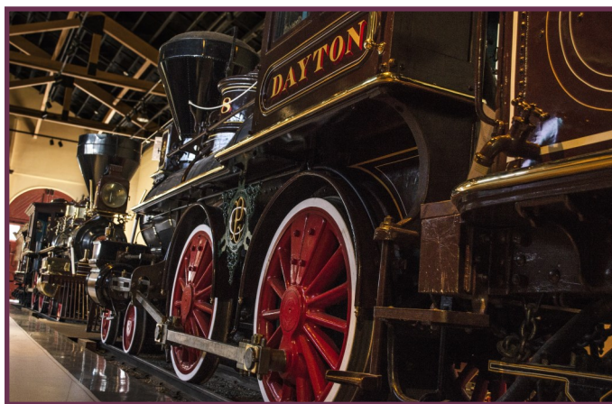
Now visitors can visit the Dayton and the Inyo (background) on Wednesdays with the museum's expansion to operations six days per week.