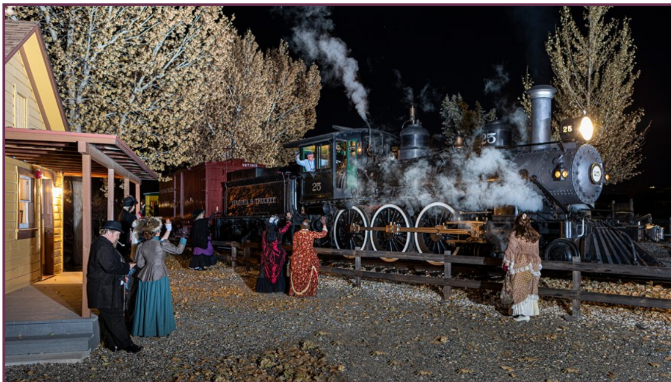
(Above) The friendly engineer of Virginia & Truckee locomotive No. 25 greets onlookers near the Nelson House on the depot track as the mixed train prepares for departure. (Below) Passengers prepare to board the McKeen Motor Car.