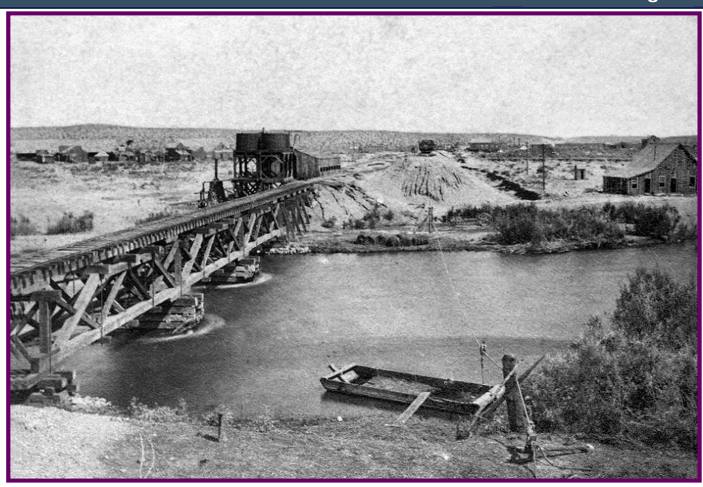
(above) Crossing the Truckee River at Wadsworth.

Because the Act had guaranteed the Central Pacific the right to choose its allotments, the railroad had proposed a section that included the fertile bottom lands of the Truckee River and extended northward encompassing most of Pyramid Lake. The C.P. argued that because the Reservation had not been set aside by Congress, the land legally remained in the public