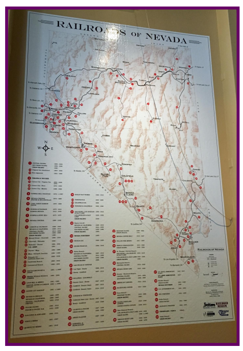
A giant wall map of historic railroads of Nevada will become a feature of the new exhibit opening in May.

Another amazing feature of the exhibit will be V&T Coach 17 (also known as the Commissioners Car). Dating back to 1868, this car was built in the Central Pacific Sacramento Shops and is the oldest piece in the museum's collection. The car was built