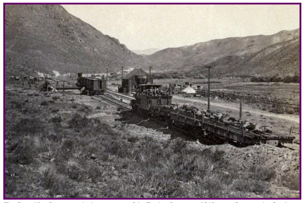
The Central Pacific entering the lower canyon of the Truckee River circa 1868, east of present day Sparks..

Surveying the route, engineers naturally sought the path of least resistance: the easiest trail through the mountains with the lowest possible elevation gains, smooth and level grades, and easy access to necessities such as fuel and water. Unsurprisingly,