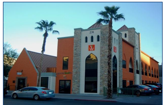
Socialwellth provides health care-oriented web and social media services from its new location at Bridger Avenue and Third Street .