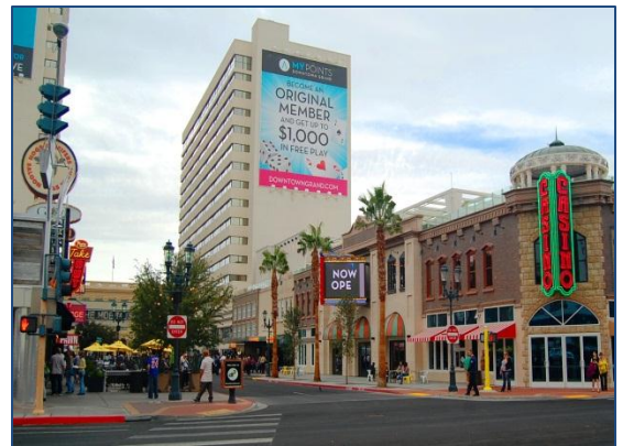
Third Street has taken on a whole new look now that the Downtown Grand has opened.