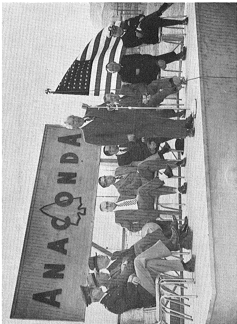
Dedication—Anaconda Copper. Growth of Nevada was McCarran's main interest.